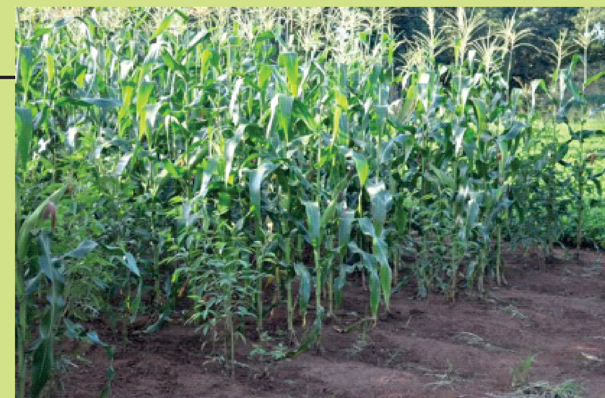
New cropping systems